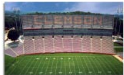
Lesco put extensive stadium experience to work to ready Clemson's Memorial Stadium for another football season.

When the enthusiastic crowds fill the 81,473 seats on fall Saturdays, they probably won't notice the work Lesco completed. But the Lesco people among the fans (and there will be quite a few) will know that it was work which required experience, proper materials, and proper installation.